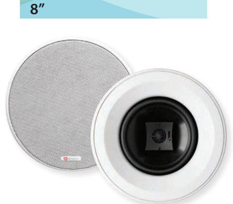
HSi 480 2-Way 8" In-Ceiling Speaker